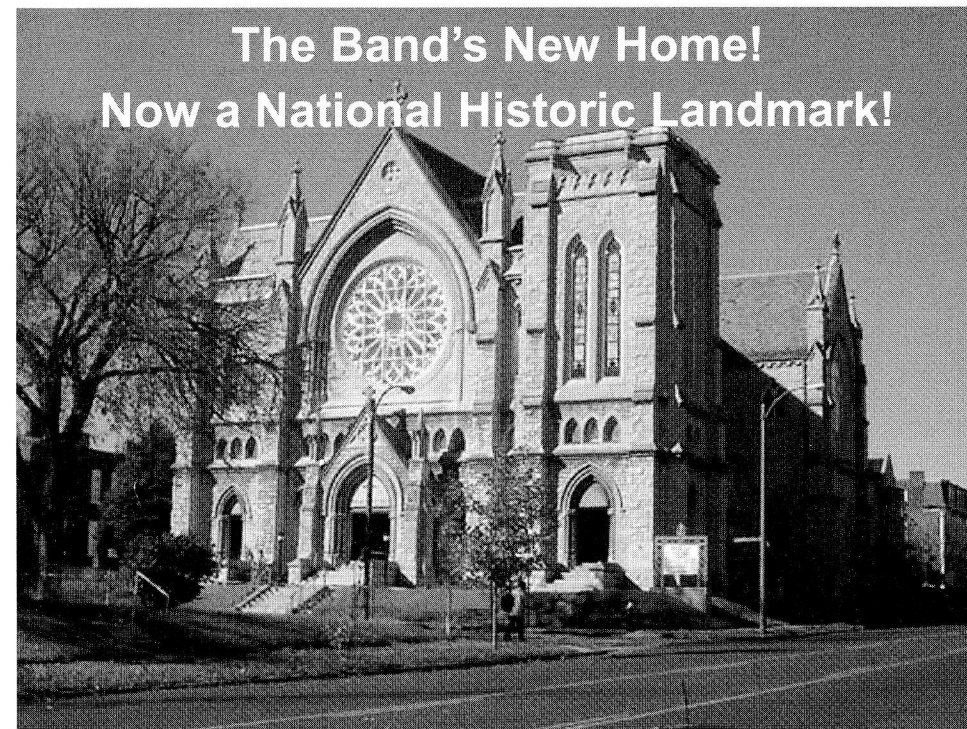
Immaculate Conception / St. Henry's Architect: Barnett, Haynes & Barnett

In addition to weekly Band rehearsals, members devote thousands of volunteer hours at bingo at Bandwagon Hall on Friday and Saturday nights throughout the year. The Band is also supported by the Clifford Willard Gaylord Foundation, Foot and Ankle Associates, Missouri Arts Council, Regional Arts Commission, Southwest Bank, St. Louis Parks & Recreation Department, Tower Grove Park, and the Bandwagon Citizen Support Group.